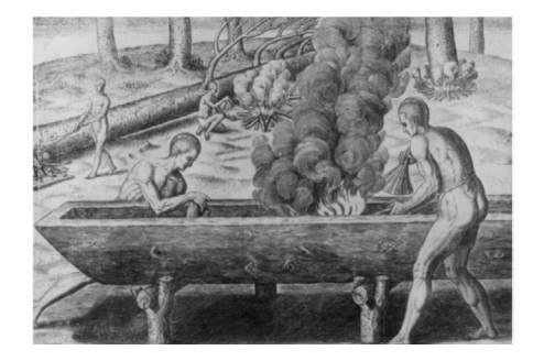
Native American dugout construction as depicted by John White, c. 1590. Image courtesy of the Library of Congress.