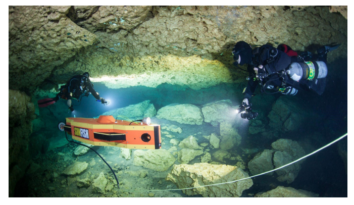
Divers use an autonomous underwater vehicle to explore submerged caves and rock shelters that would have been accessible to early inhabitants of what is now the continental shelf west of Prince of Wales Island in southeast Alaska.

Studying maritime heritage connects us to our past, helps us to understand diverse cultures, and teaches us lessons about how the environment and humans can, and do, impact each other.