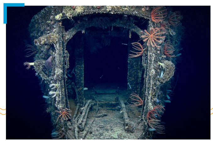
The stern of the USS Baltimore , a late 19th-century protected cruiser that served in both the Spanish-American War and World War I. The ship was present in Pearl Harbor during the Japanese attack on December 7, 1941, and was eventually towed out to sea and scuttled in 1944.

Whether used to explore, to develop trading systems, or to engage other cultures, ships and water-going craft are symbols of cultural traditions, ingenuity, and purpose. When studying a shipwreck, scientists and archaeologists try to determine its identity (including what type of ship it is, what it was used for, and its possible historical significance), what cargo it may have been carrying, what caused the ship to sink, and what artifacts may exist at the wreck site.