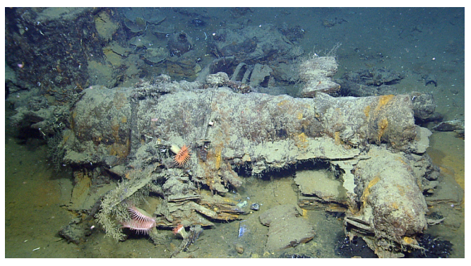
This large cannon was found on an early 19th century wreck in the Gulf of America. The muzzle, on the right, rests on top of another cannon. Learn more.