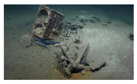
Old whaling ships had stoves on board to render whale fat into oil. Explorers believe this wreckage belongs to the 19th century whaler Industry. Learn more.