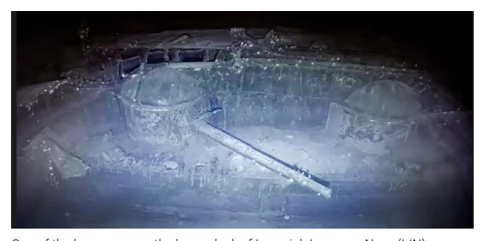
One of the large guns on the lower deck of Imperial Japanese Navy (IJN) Kaga 加賀, an aircraft carrier sunk during the Battle of Midway in 1942.