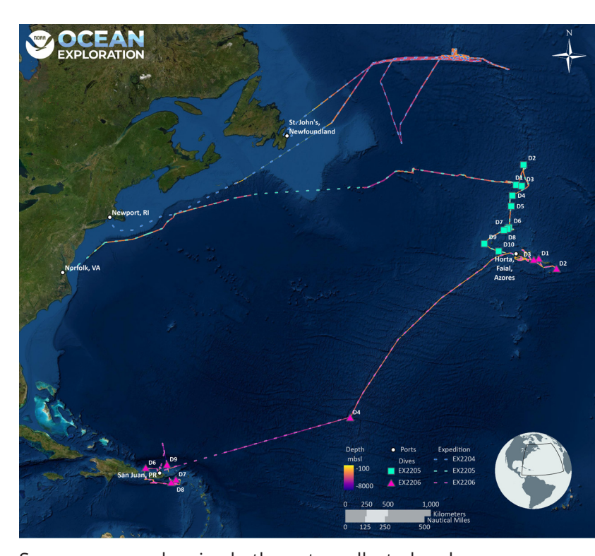
Summary map showing bathymetry collected and number dive sites for all three Voyage to the Ridge 2022 expeditions.

Voyage to the Ridge 2022 was a series of three telepresence-enabled ocean exploration expeditions on NOAA Ship Okeanos Explorer that totaled 74 days at sea. Mapping operations and remotely operated